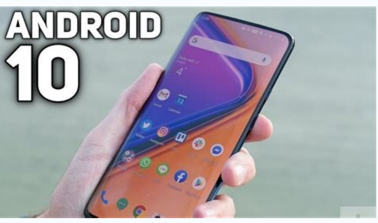
Android 10 for oneplus 6t.